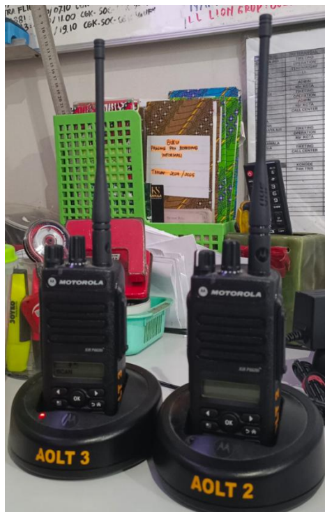
Figure 6. Handy Talkie (HT)

The two media are used to coordinate each other when the officer is in the room, located on each airport officer's desk in their respective units. At the time of the Umrah flight schedule, the numbers listed in the table and picture will appear in the PABX and Extend. The media is always used in regular flight activities and charter flights (Umrah). And the media used to coordinate when officers are in the field or traveling is Handy Talkie where each unit or officer has it. The three media are used for officers in each unit between departments to coordinate with each other.