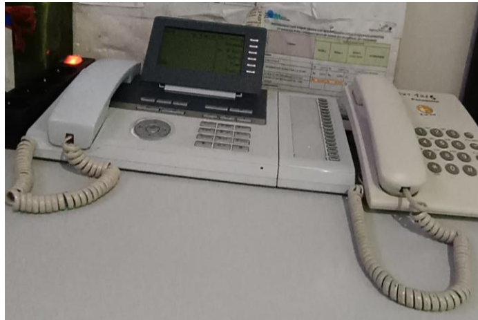
Figure 5. PABX and Extend

The two media are used to coordinate each other when the officer is in the room, located on each airport officer's desk in their respective units. At the time of the Umrah flight schedule, the numbers listed in the table and picture will appear in the PABX and Extend. The media is always used in regular flight activities and charter flights (Umrah). And the media used to coordinate when officers are in the field or traveling is Handy Talkie where each unit or officer has it. The three media are used for officers in each unit between departments to coordinate with each other.